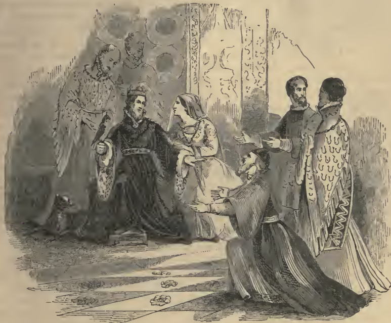
RICHARD II. AT BRISTOL. Designed from Illuminations in the Metrical History of Richard II.—Harleian MS. 1319

THE king of England issued his summons to many great barons, knights, and squires in Wales, in the country round Bristol, and on the Severn-side. Some excused themselves by sending satisfactory reasons; but others came and placed themselves under the obedience of the king, notwithstanding their conviction that it was impossible to augur anything good from the enterprise.